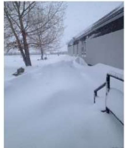
Five Foot Drifts on JH Sidewalk

Two days of bus cancellations and digging out! And now we've got snow!