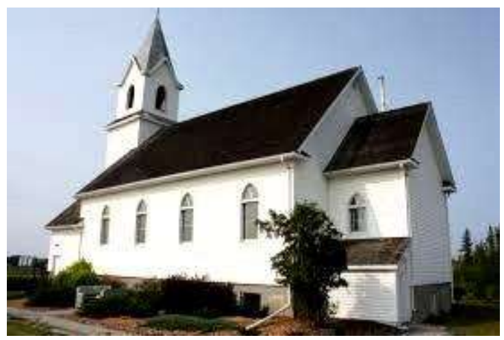
Historic Valhalla Building: Valhalla Lutheran Church

This celebration is for everyone , young and old. There will be games and a bouncy castle for the children both days (June 30 & July 1). Registration for children and students (including those attending college or university) is free if they are registered with their parents. The adult registration fee is $40 per person. Included in the registration is: breakfast, lunch and supper on June 30 and breakfast on July 1.